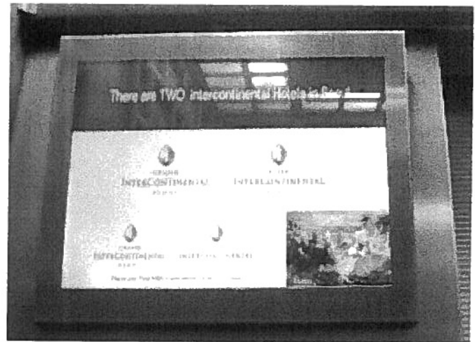
FIGURE 63.4. A high-resolution LCD display in a hotel elevator.

major benefit of these devices is that the information content displayed on them can be changed as needed. Figure 63.4 shows a high-resolution display in a hotel elevator. Such a display could provide warning information (such as an urgent instruction to exit the elevator immediately in case of a fire in the building) or other pertinent instructions. The same kind of device, but somewhat larger, could be mounted elsewhere in a building (e.g., on walls, posts, etc.) to display warning information as appropriate. It could be displayed in remote places, powered by solar cells. Of course, these devices would need to be protected so that vandalism and the elements do not threaten their operation.