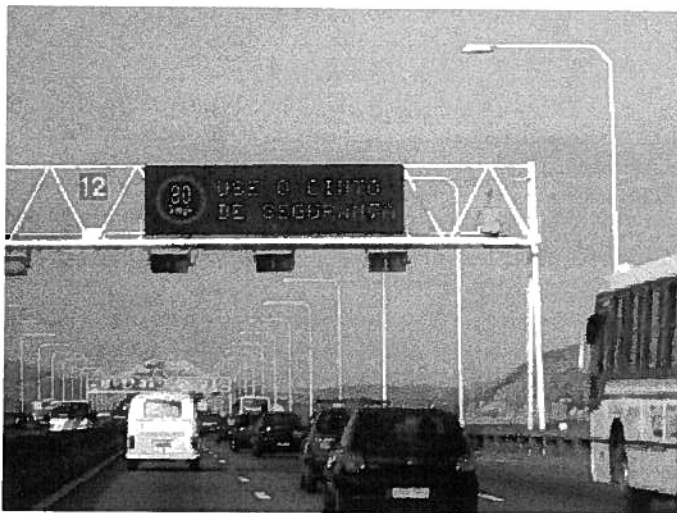
FIGURE 63.3. A changeable-message highway sign in Rio de Janeiro, Brazil. (See Color Plate 23).

One relatively recent technological innovation is the availability of flat-panel displays. High-resolution liquid crystal displays (LCDs) are now commonly purchased for use as computer monitors and high-definition televisions. Large versions of flat-panel displays (using somewhat different technologies) are also being used in sports stadiums and as advertisement billboards in big cities. Although still relatively expensive, the price associated with flat-panel displays will undoubtedly drop over time, and new uses can be considered for warning applications. One such use is in highway signs. Changeable message signs using lower-resolution technology already exist on highways in some places. Examples are shown in Figs. 63.2 and 63.3. Eventually, warning signs on highways and smaller signs in other applications will use high-resolution technologies such as those used in flat-screen LCD monitors. One benefit of these displays is that they are backlit, bright, and have high contrast, and thus are more likely to attract attention in most ambient light conditions compared with conventional signs. Most important, a