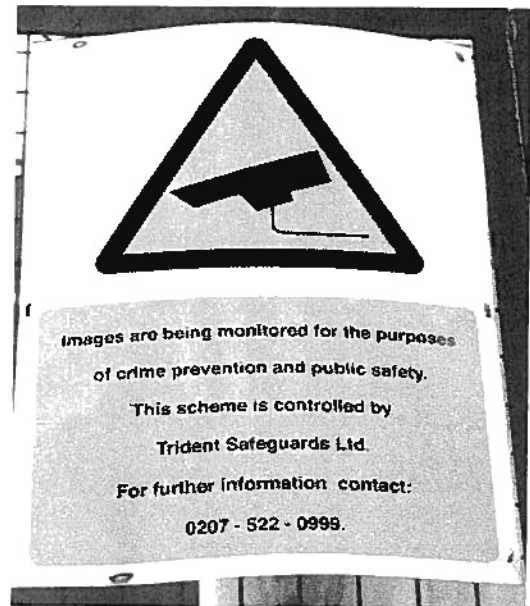
FIGURE 63.9. A sign indicating that video surveillance is being conducted.