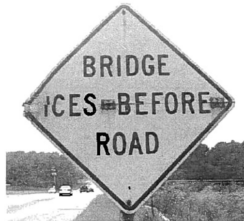
FIGURE 63.7. A sign concerning icing on a bridge displayed on a hot summer day.