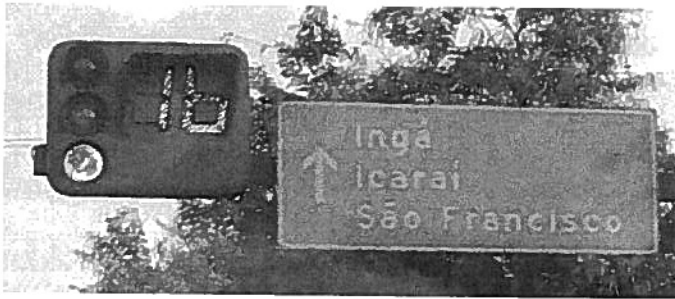
FIGURE 63.2. A traffic signal countdown sign. (See Color Plate 22).

methods of displaying warnings made possible by new technology are described. Their purpose is to facilitate warning delivery.