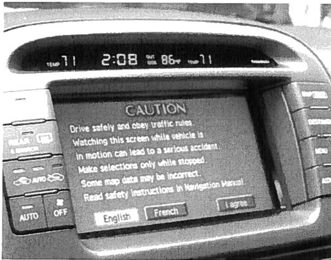
FIGURE 63.5. An in-vehicle navigation system display showing a warning.

of Chy-Dejoras (1992) suggested that video displays can be an effective means of conveying safety information.